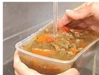
MEAT WASHING SCANDAL: Find out what our hidden cameras uncovered.