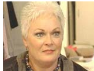
ROWENA WALLACE: Once 'Pat the Rat', the soapie star now owes Centrelink.